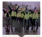
LEARN TO RIDE