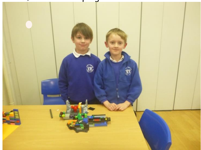
Island with radioactive goo