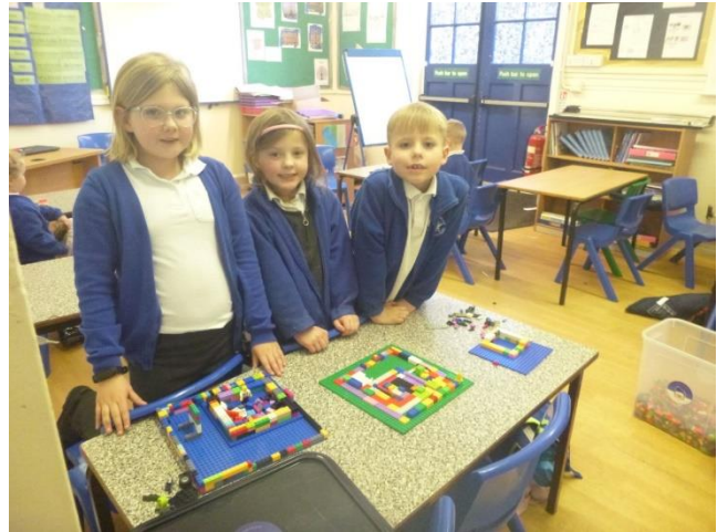
House, hot tub and play house